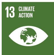
Protect the climate