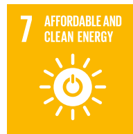
Use green electricity